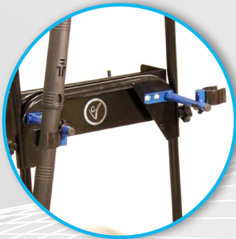
Two holders for different attachments