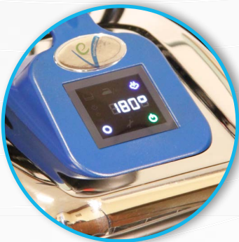
Touch screen display with counter