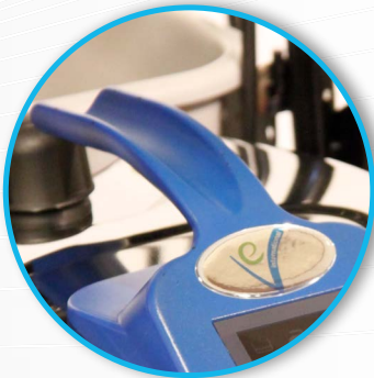
Industrial handle for separate use