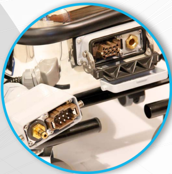
Industrial plug with safety lock