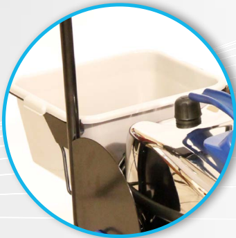
Basket for accessories and towels